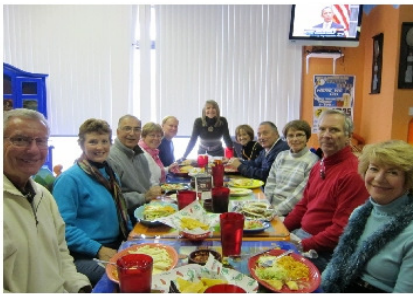
11 others showed up, but didn't stay